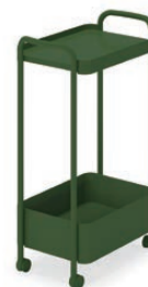
AWG-AN2 - Q6A 1