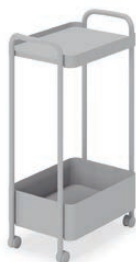
AWG-AN2 - E2A 1