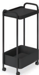
AWG-AN2 - E6A 1