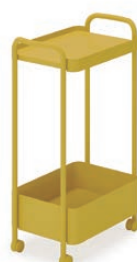
AWG-AN2 - 1SA 1