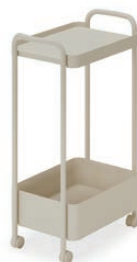
AWG-AN2 - M1A 1