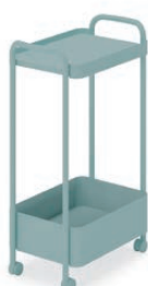
AWG-AN2 - 39A 1