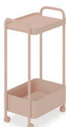
AWG-AN2 - 9GA 1